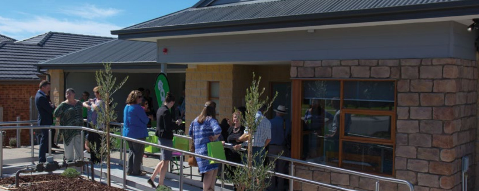
Opening of Officer accommodation