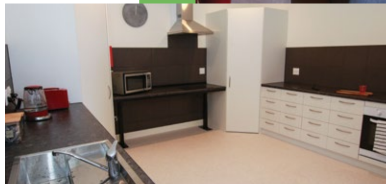
Living area and fully accessible kitchen