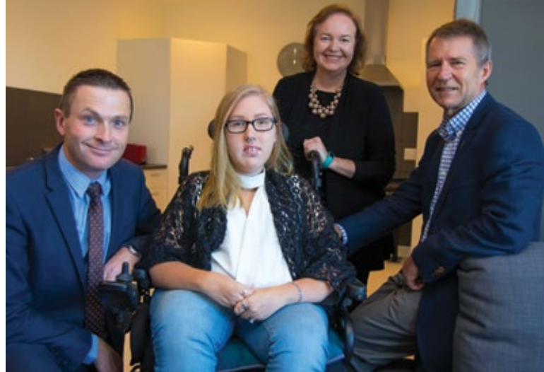
Kira at the Official Opening - pictured with Cr Brett Owen, Mayor Cardinia Shire; Senator Carol Brown, Labor Senator for Tasmania, Shadow Minister for Disability and Carers; EACH CEO Peter Ruzyla

The need for further disability accommodation for people currently residing in institutional settings, group homes or aged care, or at home with ageing parents is well recognised by EACH Housing and we are committed to further projects in this area.