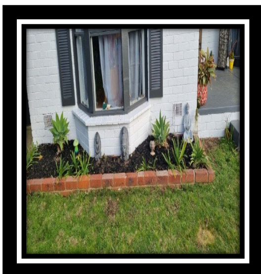
Coopers front Garden (above)