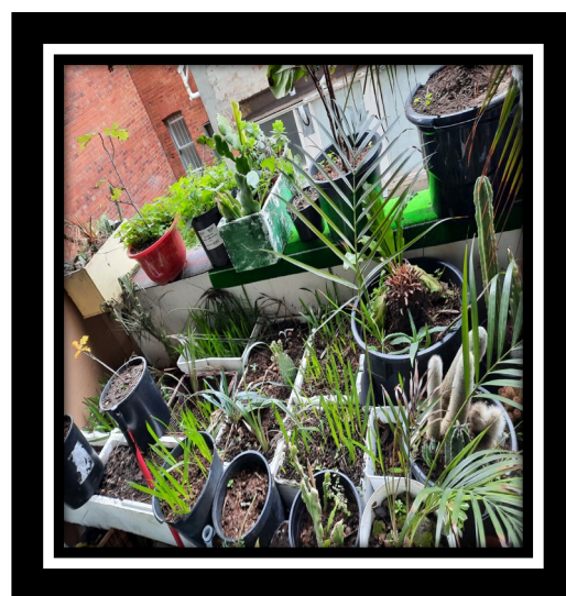
Barry's balcony Garden (above)